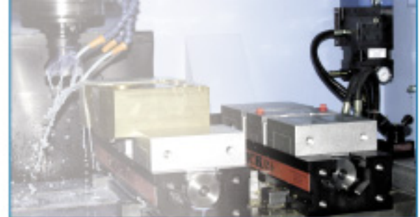
TASQ-60 for Power Work Holding

Optional: 80 cu. in. Self Contained Reservoir